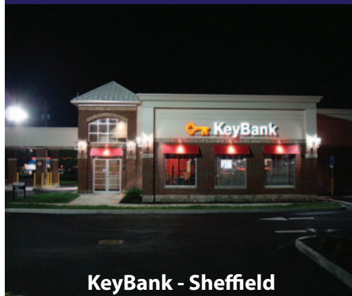
KeyBank - Sheffield

We spend all summer getting ready for winter!